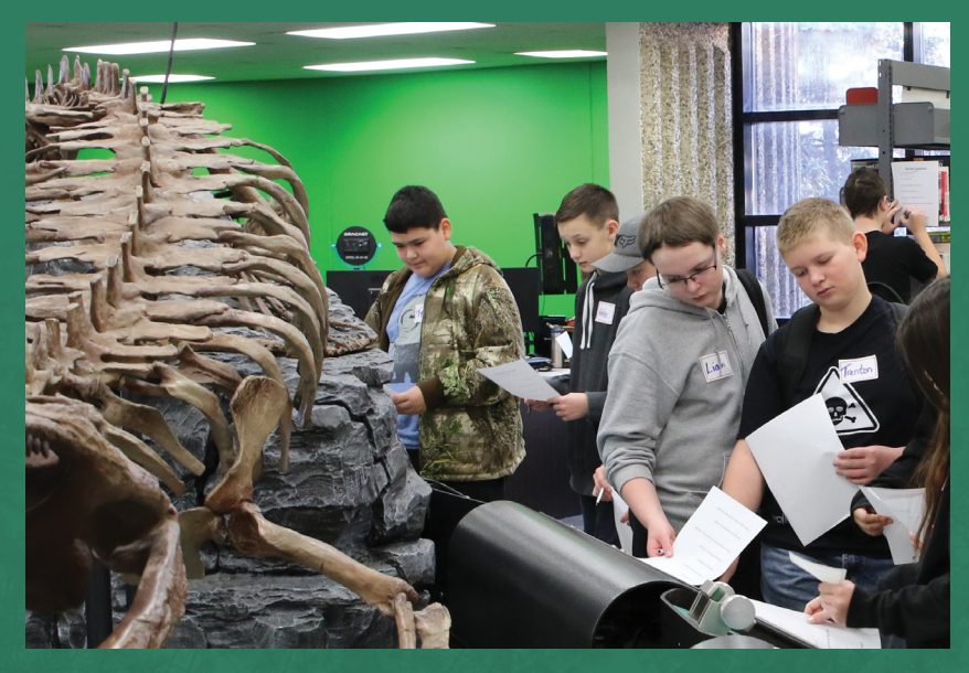
Saskatchewan Rivers Public School Division strives for excellence in education and seeks to maximize each child's unique learning ability.