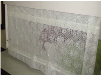
Children may climb or crawl in and out of this space.

Physical space, both indoor and outdoor, is dedicated to all children's learning and interactions. An effective design for defining areas combines a partial opening or gap with temporary partitions formed by portable screens, movable half walls, storage shelving, solid/transparent fabrics or wooden structures to enclose several sides of the area.