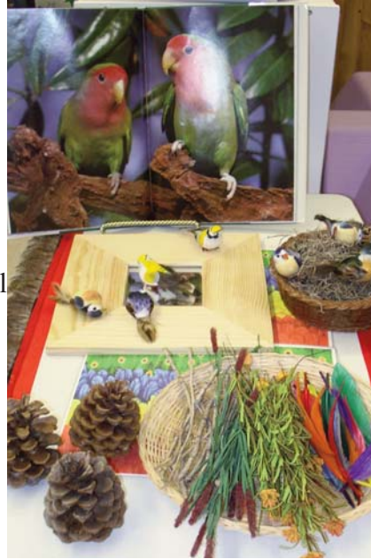
Objects are offered to expand children's engagement with birds.