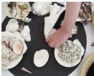
Collections of shells allow children to experience various sizes, textures, colours and shapes.