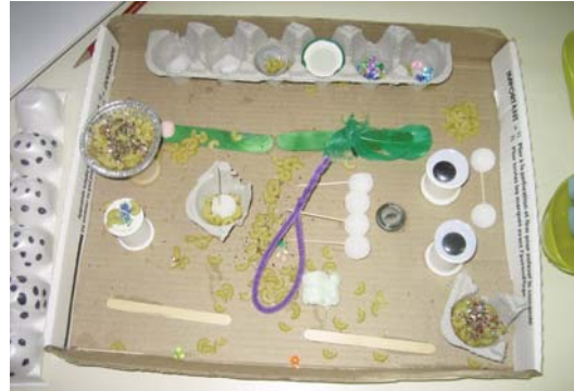
Children used objects to represent their ideas in a three-dimensional structure. The structure is displayed for others to view.