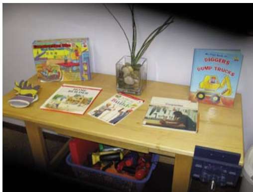
Furnishings and all displays are accessible to children of various abilities to see and explore.