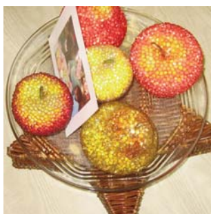
Interesting objects promote children's curiosity.

Supporting the intellectual aspect of the environment arises from rich resources, flexible schedules and caring support offered in the space design. When children are trusted to make choices and decisions during their time in the setting, they are quick to demonstrate their capacity to ask questions, seek answers and work together on projects. Educators ensure that the environment complements the interests, suggestions and activities of the learners. Using their combined ideas, children and adults construct holistic environments that provoke questions, capture the imagination and stimulate curiosity to learn more (MacNaughton, 2003).