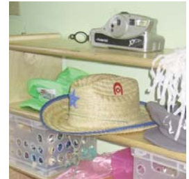
Props support dramatic play.

The space design and arrangement considers the large items of an environment. Often these features are fixed as part of the structure of the space, and educators should keep these components in mind when creating early learning environments for children. Examples include placement of windows, doorway, sink, playground equipment and an outside access door.