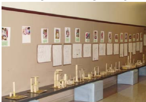
Children's projects and creations aesthetically and respectfully displayed.