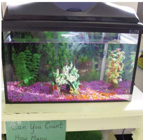
An aquarium provides a habitat for fish.