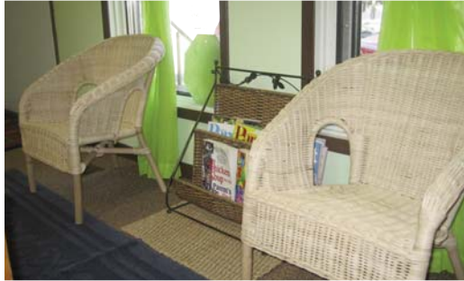
Pillows, small chairs and sofas offer welcoming and transition spaces for children, families and educators.

Children and adults can observe the various play possibilities and move in/out of the spaces with ease. This type of modified open plan (Moore, 2002) offers easy access and flexible arrangements for learning choices over time. Children can identify and engage with those activities and resources that match their current interests and curiosity.