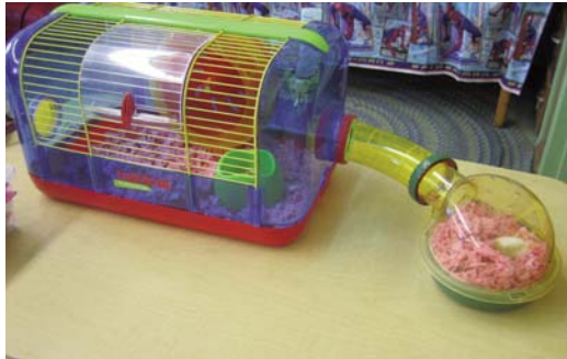
Hamsters and fish add multi-sensory learning experiences to environments.

Because the natural environment is also strongly linked to the physical, social-emotional and intellectual aspects, learning opportunities are rich, integrated and diverse. Appreciation of the natural world is further strengthened when natural materials are incorporated into the indoor environment. Children learn to value the environment when they are exposed to living organisms. Children develop a sense of responsibility when they participate in sustaining growing plants and caring for animal pets.