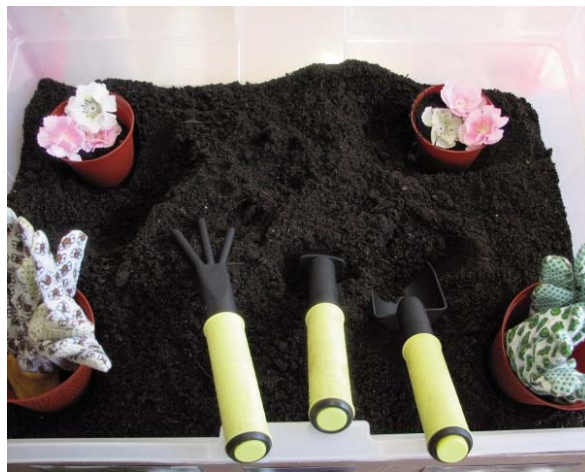
These materials are presented to invite children to garden.