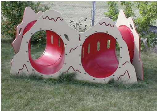
Crawl structures may be permanent or temporary.