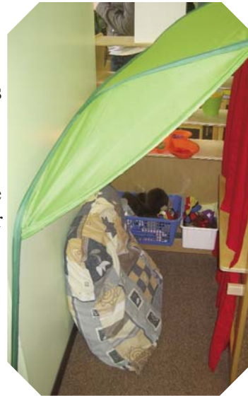
This space features a pillow for comfort. A roof as a hideaway and the puppet theatre on the right provide a partition to this special space.