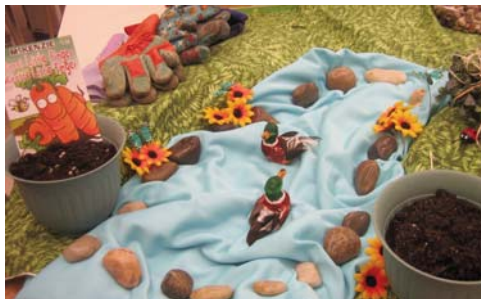
Books and natural and commercial props are offered to engage children in exploring the season of spring.

Table tops can be transformed with mirrors, flowers or herbs with appealing aromas to provide children with greater sensory learning opportunities. Water also provides another sensory learning experience when offered in a variety of containers such as shiny metal tubs along with stones and shells or objects that float.