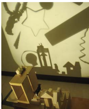
Blocks and an overhead projector invite children to build.

When young children select complex resource materials and participate in meaningful activities, they make multiple connections across holistic growth and development.