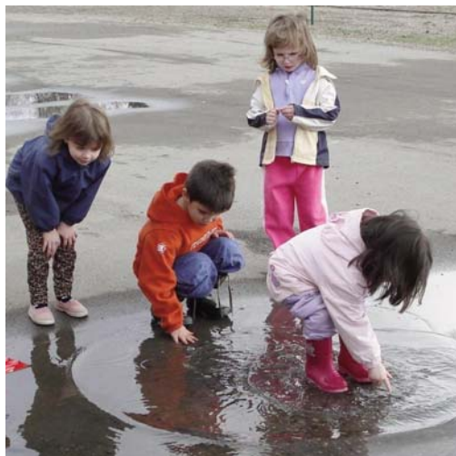
Splashing in a puddle to determine how far the water will reach.