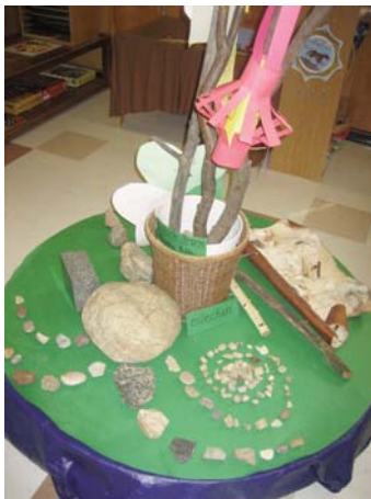
A discovery table featuring natural objects.

The spiritual aspect of the environment reveals the wonder and beauty of the natural world. Living plants and animals as well as complex objects, such as rainbows, clouds, shadows, puddles or sand, offer enticing possibilities for learning. Children's curiosity and desire to appreciate and understand their world stimulate ongoing investigations of naturally occurring phenomena.