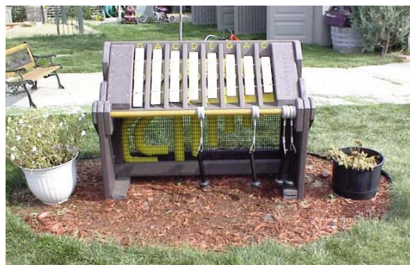
A xylophone that is raised in height enables people with a mobility or physical disability to manipulate the instrument.

Most of the features of indoor environments are also appropriate in the outdoor environment. Parallel components in indoor and outdoor areas include the space design and the available materials and presentation. Components can be replicated inside and outside, depending on the time of year and weather conditions.