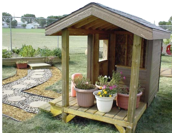
Playhouse and pathways for children's outdoor engagement.

Most of the features of indoor environments are also appropriate in the outdoor environment. Parallel components in indoor and outdoor areas include the space design and the available materials and presentation. Components can be replicated inside and outside, depending on the time of year and weather conditions.