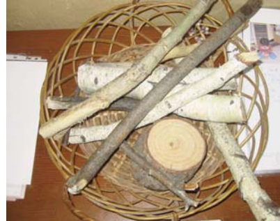
An open basket of sticks is accessible to children and allows the materials to be used in creative ways.

As the early childhood educator observes and listens to the children, a common interest may surface from their conversations. The educator should note the children's ideas and activities to gain new information about additional props that might extend their learning. For example, the sand table might hold seeds paired with a variety of bowls, scoops and cups to extend children's exploration and investigation of measurement and spatial sense. As interests change, a collection of coloured marbles, beads and other small round items fill the table to extend the learning experience.