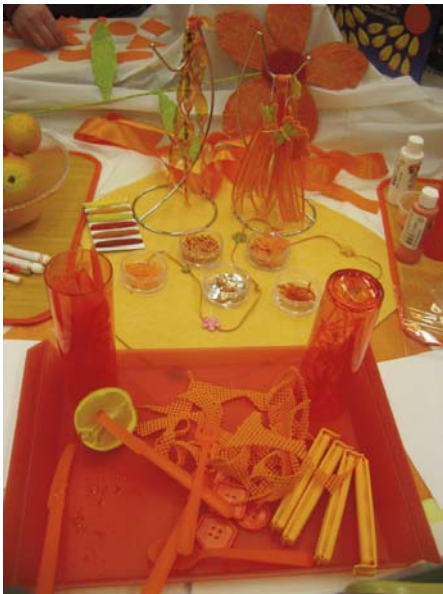
These materials invite children to interact with orange-hued objects.