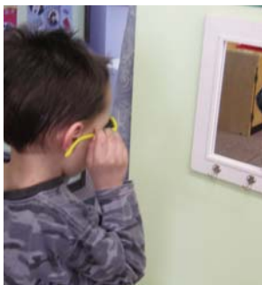
Mirrors add opportunities for children to observe themselves, building self-identity.

Environments promote children's social development through design features that invite dramatic play, collaboration in projects and relationships with peers and adults. Experiential centres with simple and/or complex resource choices (Moore, 2002) accommodate groups of children to gather, to discuss and to plan their play investigations. Independence, interactions and explorations flourish within the setting. These cooperative ventures support a sense of belonging and self worth. Children widen their understanding of who they are and what they can contribute to projects during play interactions.