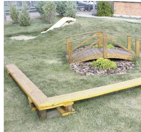
A slide, a bridge and small group seating area for outdoor experiences.

Children benefit from rich and stimulating play choices outdoors as well as indoors. Finding the balance between the indoor activities and outdoor explorations is part of a purposeful planning process. While climate and weather conditions can affect access to outdoor experiences, it is also possible to bring the natural world into the indoor space. Mixing natural with commercial or recycled resources enhances both settings with a variety of materials and appealing smells, colours, sounds and textures.