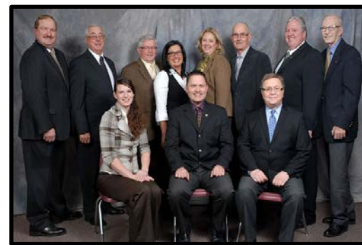
2015-16 Board of Education and Director of Education

Thank you for your continued support as we strive to provide excellence for every learner.