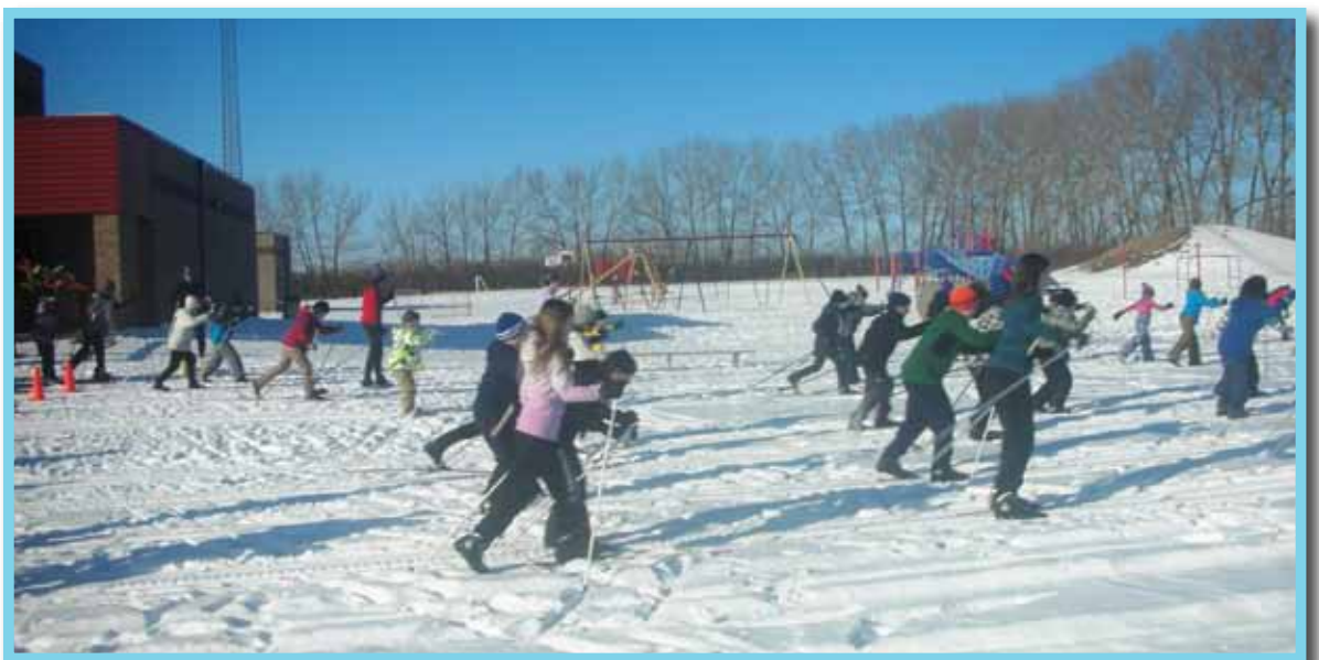
Students enjoying Ski Loppet.

It was a fun-filled day with lots of great skiing, awesome weather, and a wonderful chance to spend some time skiing with other schools.