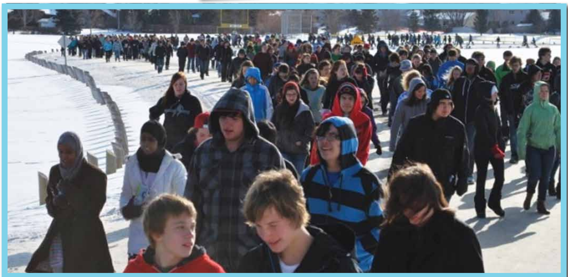
Carlton students and others walking to promote healthy living.