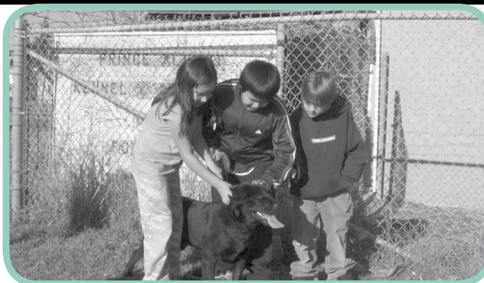
Students help out at the SPCA!