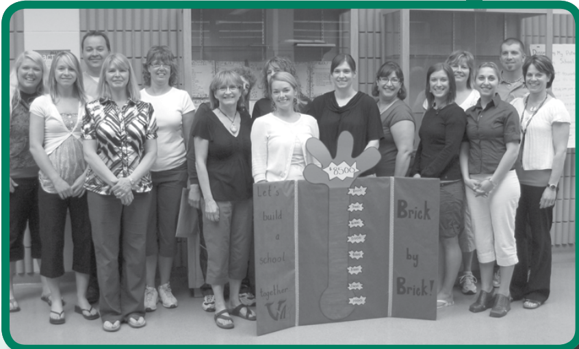
ÉCOLE VICKERS BRICK BY BRICK TEAM!

Hats off to the global minded community of École Vickers School and others!