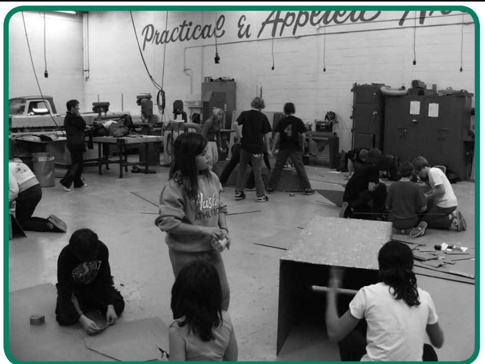
I wonder what they are doing?

The Cardboard Boat Challenge is a team event, with each team being made up of 4 students from a school. This year 20 teams from