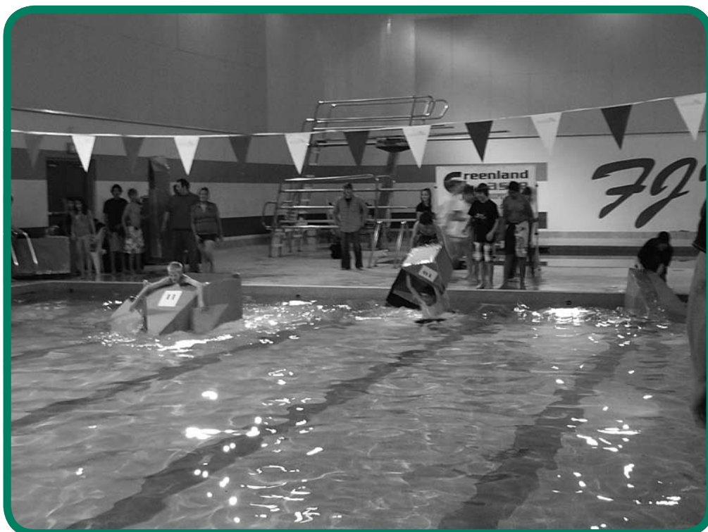
The race is on!

10 schools were involved in the competition. Each team that participated in the boat race had to design, construct, and race their cardboard boat across the Frank J. Dunn Swimming Pool. Additional points were allotted to teams that could keep their boats afloat with all crew members aboard.