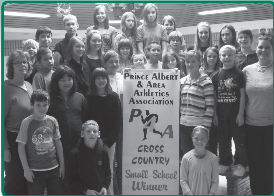
Small School Winner - Wild Rose School Cross Country Team