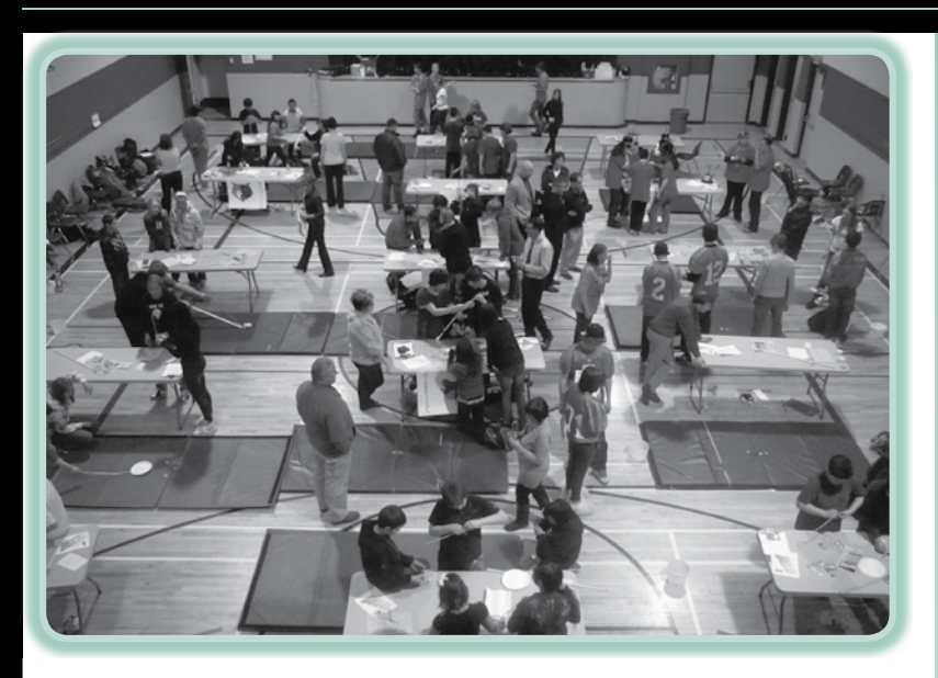
Destination ImagiNation Challenge Day