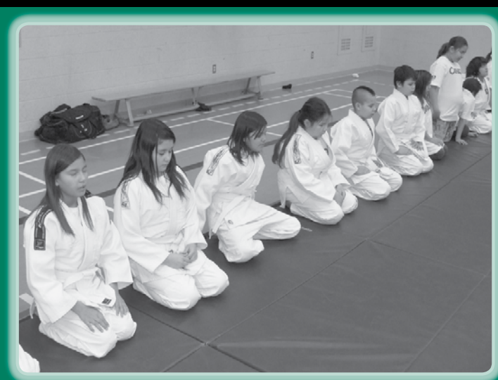
Westview students Judo class

During our judo lessons, we do exercises, front rolls, somersaults, cartwheels, play games, and practice breakfalls. We learn judo strategies and moves. We also learn some Japanese words. Sensei says we are learning the basics and that respect is an important part of all of our learning. We are getting faster and better each time. At the end of 10 weeks, he invited us to the dojo for a special morning of judo and a celebration of our learning. It was an exciting visit.