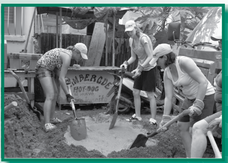
Students mixing concrete

The mission was not all work and no play. Everyone thoroughly enjoyed the two half days spent with the children of Aqua Negra. Games of skip rope, football, and volleyball were played in a little muddy area near the river, the same river that carried the garbage and household waste. The young children loved playing with the "gringas"